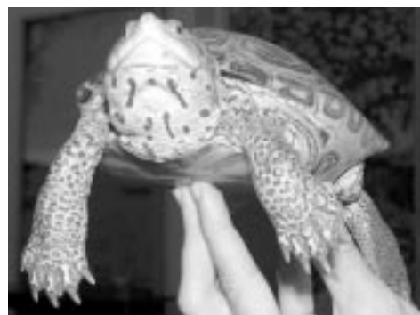
A female Diamondback Terrapin.

If you would like a full copy of the revised Handbook of Frequently Encountered Rules & Regulations, you may pick one up from KICA Administration at 23 Beachwalker Drive between the hours of 8:00 a.m. and 5:00 p.m., Monday through Friday. You may request a copy by calling KICA Member Services at (843) 768-9194 or toll free at (866) 226-1770. Or you may view the handbook on KICA's website, www.kiawah-owners.org .