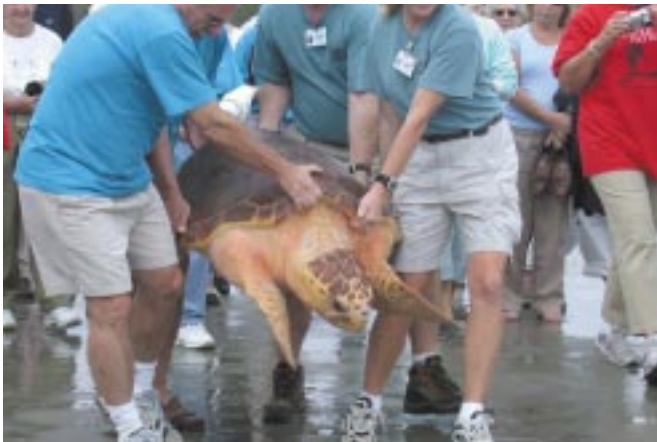
Volunteers carry Georgia closer to the water.