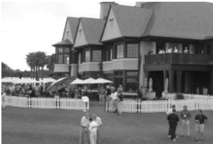
Spectators gathered at the Cassique clubhouse.

Hundreds from the Kiawah community worked to make the UBS